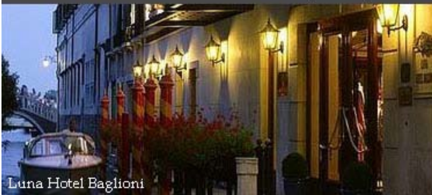
Luna Hotel Baglioni

Visit Luna Hotel Baglioni and get daily American buffet breakfast served at the Marco Polo Ballroom. Receive a one-category room upgrade at time of booking in addition to one night free. For Suite Reservations: One 3-course dinner for two served at the Canova Restaurant, excluding beverages.