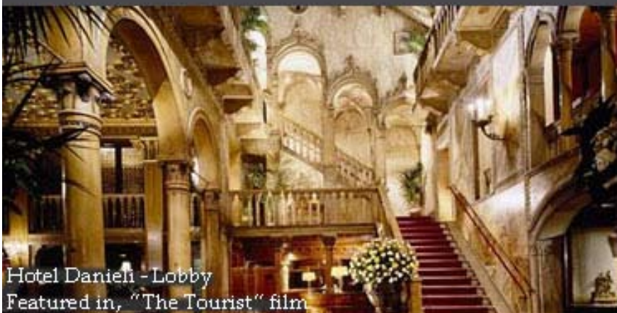
Hotel Danieli - Lobby Featured in, "The Tourist" film

Hotel Danieli, previously featured in the film, "The Tourist" is located in one of the most prestigious positions in Venice. The hotel's setting so close to Piazza San Marco conveniently locates it next to shopping, museums, outdoor cafés, and the most interesting attractions Venice has to offer.